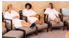
VITALITY AT SEA SPA AND FITNESS CENTER