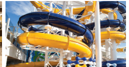
POOL AND SPORTS ZONE